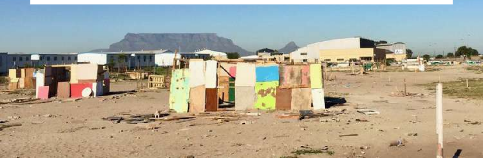
A sports field in Dunoon near Milnerton