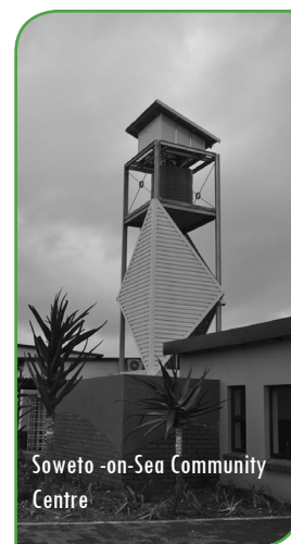
Soweto-on-Sea Community Centre

Send your tips for a raising strong students to warafana@gmail.com and we will publish it in next month's issue.