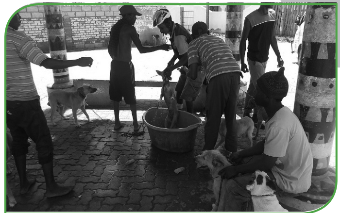
Each man with his dog: Animal owners dip their animals to prevent diseases.