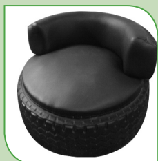
Sofas and Furniture

Each and every year thousands of rubber tyres are thrown away. Many are dumped everywhere in our backyard making our homes look untidy and harming the environment. Here are some interesting ways to turn those old tyres into features that will beautify our homes, and maybe even make us some money!