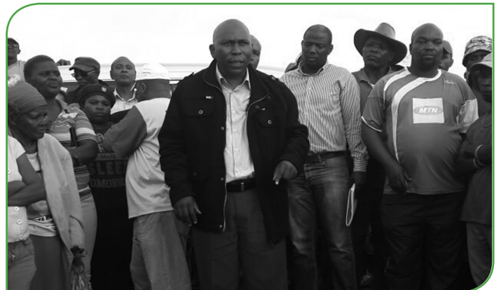
A community meeting during the awarding of contracts to prospective SMME's and established contractors .

The established contractors awarded 100 house are expected to sub contract 20% of the value of their work to local sub- contractors. 3563 beneficiary families will benefit from this Housing Settlement projects.