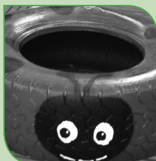
Swing for Kids