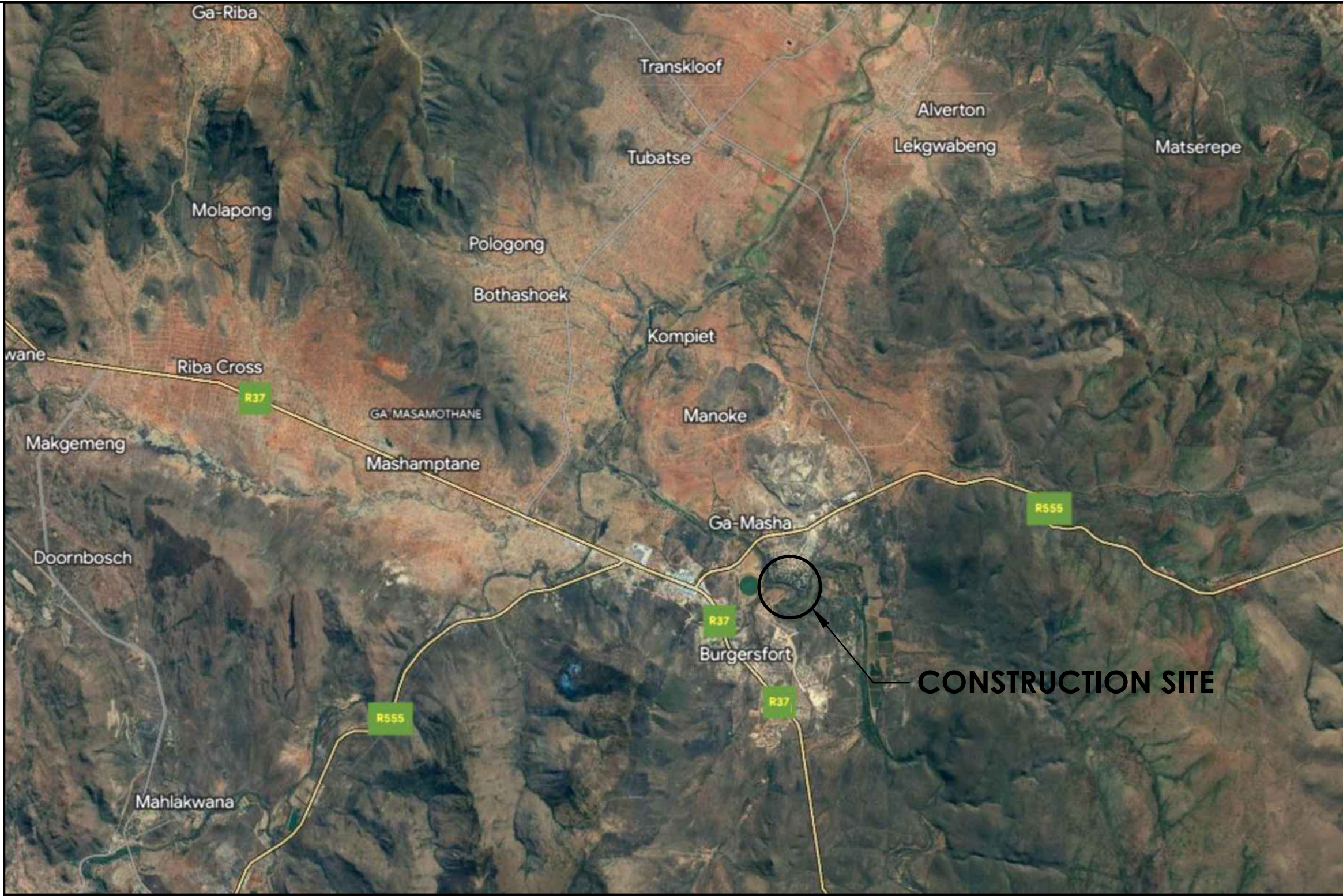
LOCALITY PLAN SCALE 1:10 000