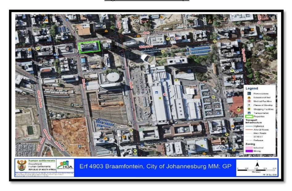
Figure1: Location Map:

Procurement of a service provider to provide locksmith services.