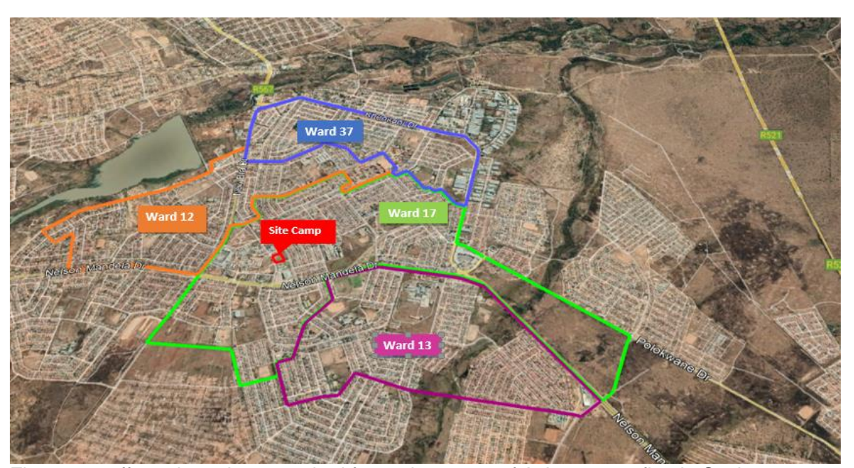
Figure 1 – affected wards earmarked for replacement of Asbestos roofing in Seshego

Seshego town is located within Limpopo. It directly lies northwest of Polokwane central business district within Capricorn District Municipality. Most of the residents of this town work in Polokwane central business district.