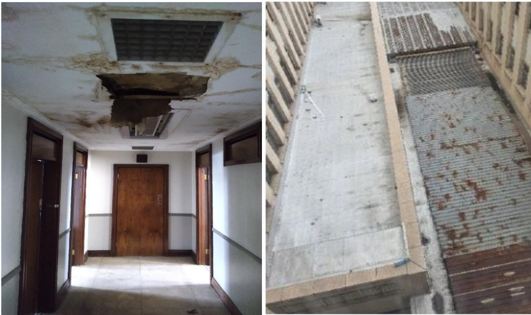
Figure 4: (Source: HDA – Soffit slab and roof condition)