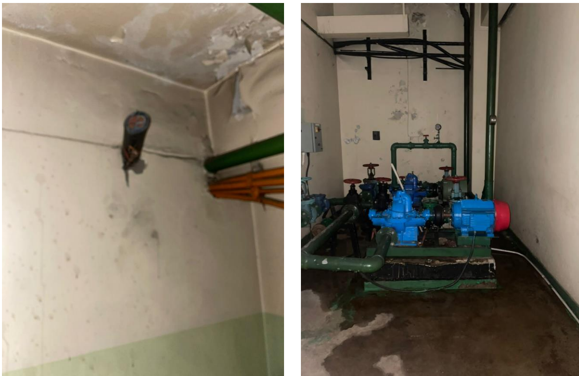
Figure 5: electricity supply cable stolen.

Electricity was supplied by both Eskom and CoJ in the building and since then all electrical cables including copper bars from Eskom have been stolen from the building resulting in the non-functioning of lifts, aircons, lights, pump systems etc. Figure 5 below depicted the condition of electrical supply cable and water management supply equipment.